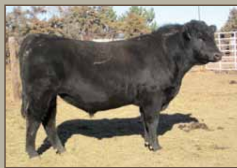
CFC Powertrain 3A3

Offering: 45 18-24 month old beef bulls - plus 7 yearlings 34 Angus, 18 SimAngus - 15 suitable for virgin heifers