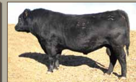
Sinclair Rito Promise OR12

Sire of thickness, volume and longevity. Dam is currently raising her 9th calf. Granddam raised 13 calves before ET, then lived to 20.