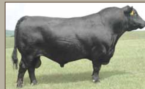
Sinclair Open Range 2Q23

Proven bull that sires above average growth and solid carcass cattle with extra muscle and middle.