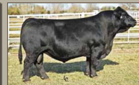
TNT Tanker U263

PB Simmental sire that ranks in the top 1% of the breed for yearling weight and ribeye, has worked very well to make F1s on Angus cows.