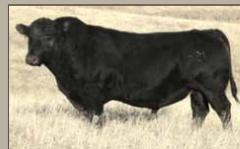
Cole Creek Full Bore 730

High performance sire that adds length and muscle to Angus cattle, daughters are productive and easygoing.